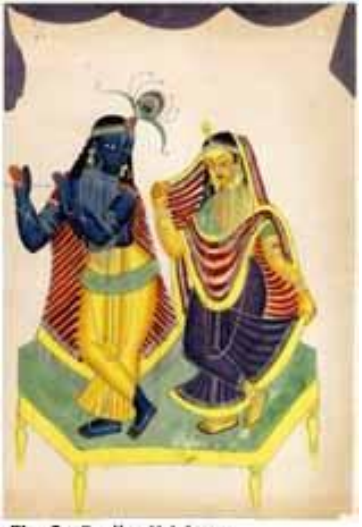
Fig. 2 : Radha Krishna

Kalighat paintings were created by patuaswho migrated from Bengal villages into Calcutta and set up their "shop-studios" around the Kalighat temple. Kalighat patuassaw opportunities in the urban developments in Calcutta.They modified the traditional scrolls which Artisans and craftsmen of rural Bengal especially from 24 Paraganas and Midnapore had painted long narrative stories on scrolls. These often stretched over 20 feet in length and were known as patachitra. Each section was known as a patand the artists therefore became known as patuas. The visitors to Kalighat did not want to buy long scrolls. Therefore first change came into