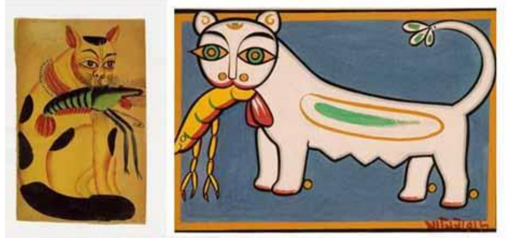
Fig. 10: (left) Typical Kalighat painting ; (right) Jamini Roy art

http://anubooks.com/product/artistic-narration (p) ISSN: 0976-7444, (e) ISSN: 2395-7247