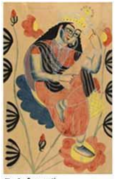
Fig. 3 : Saraswati

At the beginning, figures were outlined in pencil and then the base color was swiftly applied in broad wet strokes. To get the sculptural volume a darker hue was added before the base coat was dry, to avoid tide marks. There is no sense of using scientific perspective. Faces were mostly drawn in three-quarter profile. To differentiate figures and the eyes, noses, and fingers or to denote folds and partings in drapery they were used rapid, thin short strokes in black or in a dark color. They used thick black lines to outline the pad or the border of the cloth and too were shown as a black block. A flat middle tone was used as a color-wash for clothes to differentiate them from the body. With shaded contours and articulated gesture and