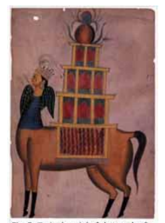
Fig. 5: Taziya(model of the tomb of Hasan and Husain at Kerbala)

MANIPULATION OF RELIGIOUS AND MYTHOLOGICAL THEME The main focus was given on Hindu deities, episodes from Ramayana and Mahabharata. Although Kali (Fig. 1)was the favorite which was quite reasonable and apart from that Shiva in the form of Panchanan or sitting along with Parvati on Nandi or carrying Sati, Lakshmi herself or in the