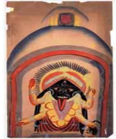
Fig. 1: Goddess Kali in Kalighat Temple

Kalighat Paintings emerged as a product of the changing urban society of the nineteenth century Calcutta, with the growing importance of the kalighat temple as a pilgrimage centre in the then British capital, Calcutta. Basically this was the class of paintings and drawings on hand-made or more usually on machine-made paper produced by a group of artists called 'Patuas' that developed and flourished in response to the sudden prosperity brought to Calcutta by the East India Company trade in between as early as the 1830s until the 1930s at the market place around the famous Kali temple, at Kalighat, in Calcutta. These inexpensive pictures would have been purchased initially as mementos of a trip, and subsequently would have decorated a