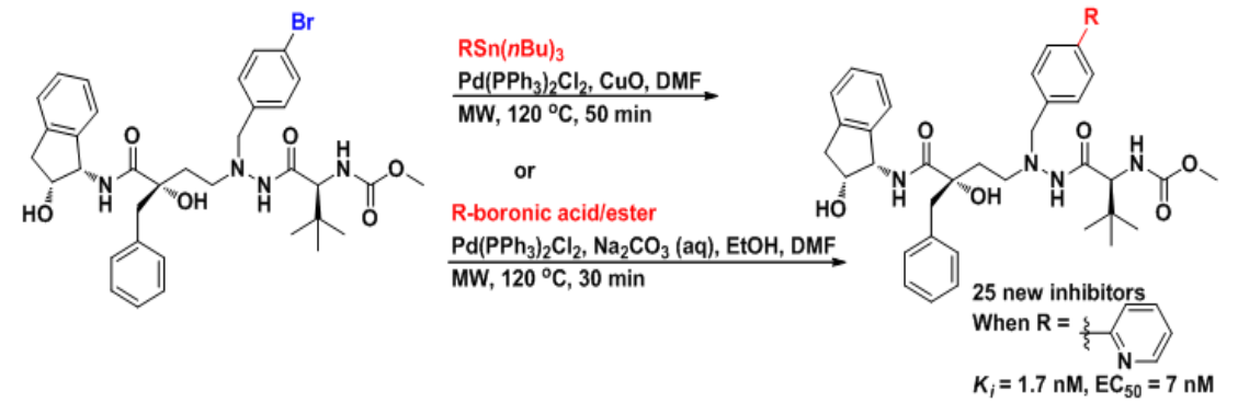
Sch-2. Microwave assisted Rapid synthesis of Target compounds <sup>(Hong</sup> Liu & Zhang, 2011)

Lead generation and optimisation : Microwave irradiation was used to accelerate a key step in optimisation of new potent HIV-1 protease inhibitors. With microwave enhancement, target compounds were synthesized using Stille or Suzuki cross couplings at 120°C for 30-50 min. all with retained (S)-configuration at quaternary carbon.