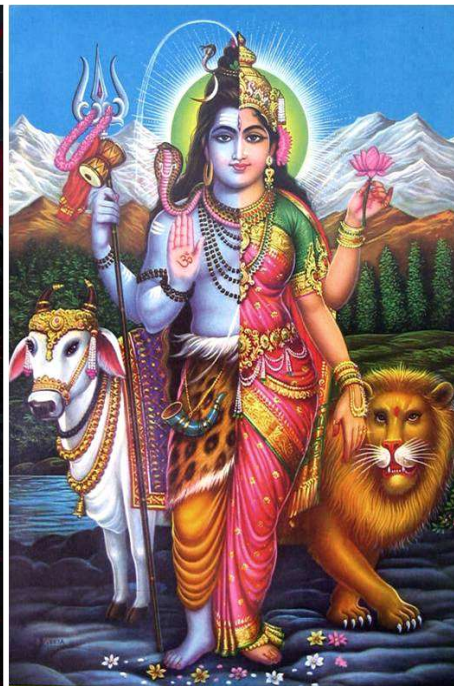
Plate no. 4