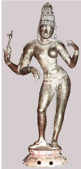
Plate no. 5