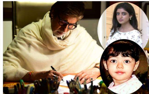
Plate no. 2