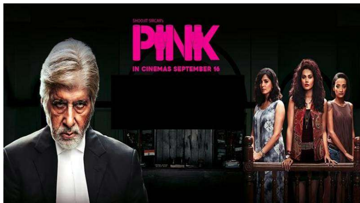
Plate no. 6