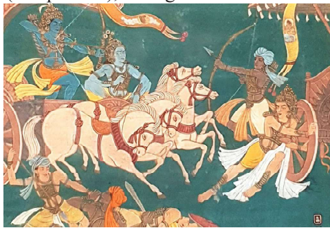
Mahabharata through paintings by Nandalal Bose

Application of Rasa: Bose's works often reflect a deep engagement with Indian mythological and folk themes, conveying a range of rasas. His illustrations of the Ramayana and Mahabharata display a rich emotional palette, including Adbhuta (wonder) and Karuna (compassion), through innovative use of line and form.