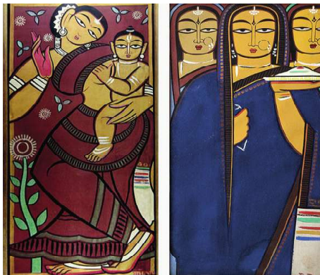
Art Focus – Journey to the Roots –Jamini Roy 1887-1972

Application of Rasa: Roy's paintings, such as those depicting scenes from rural Bengal and traditional myths, often evoke a sense of Karuna (compassion) and Shringara (beauty). His use of vibrant colors and simplified forms creates a distinct emotional resonance that connects with viewers on an intimate level.